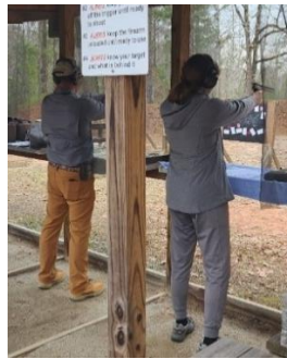
Pistol Target Shooting